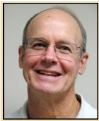
From the Board Chair and President/CEO