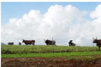
LAND USE & RURAL CHARACTER