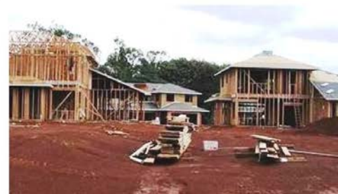
ECONOMIC & BUSINESS CLIMATE