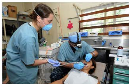
COMMUNITY HEALTH & WELL-BEING