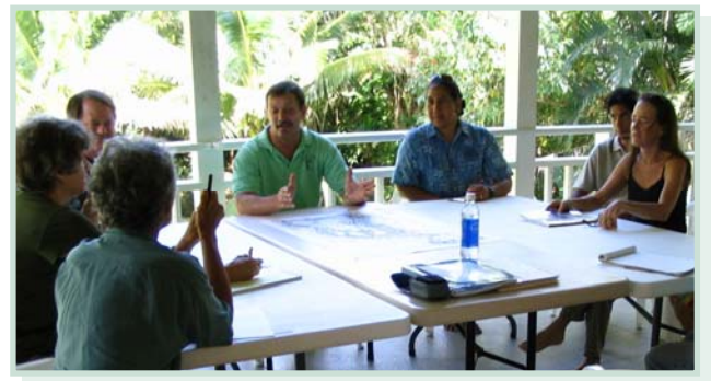
Parks Action Team hold a committee meeting at Limahuli Garden and Preserve.