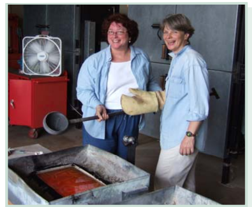
Staff preparing a KPAA sign for the office from recycled glass at Kaua'i Recycling for the Arts.