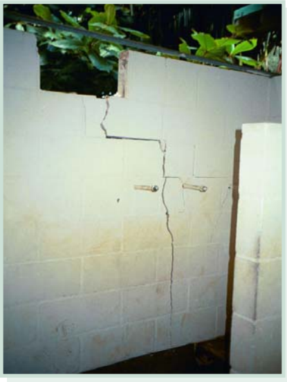
A restroom at Haʻena State Park in need of major repairs.