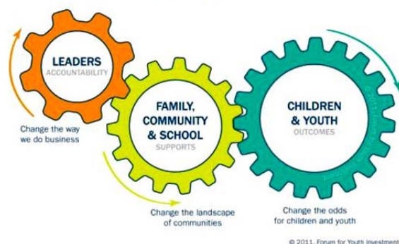
The Ready by 21 Theory of Change