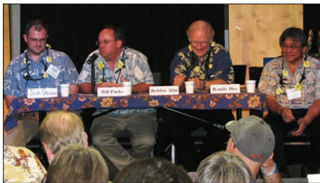
Energy Panel, February 2009.