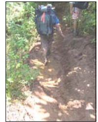
Hikers face poor drainage and soil erosion on the Napali Coast Trail.