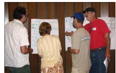
Residents discuss priorities for Kaua'i sustainability at a meeting in Lihu'e.