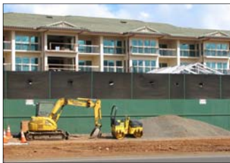
New development has changed the island's landscape.