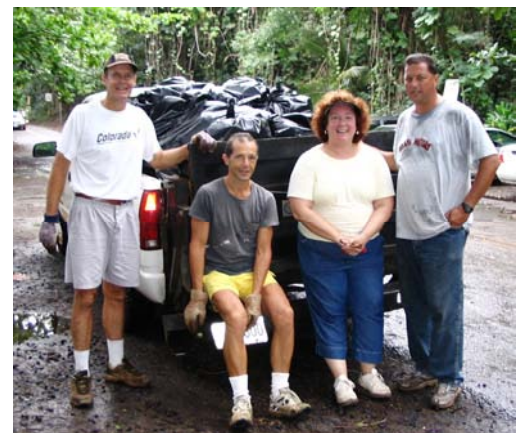
Friends and staff of KPAA collect trash at Ke`e Beach.