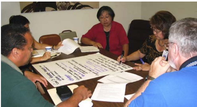
Education Action Team members set goals.